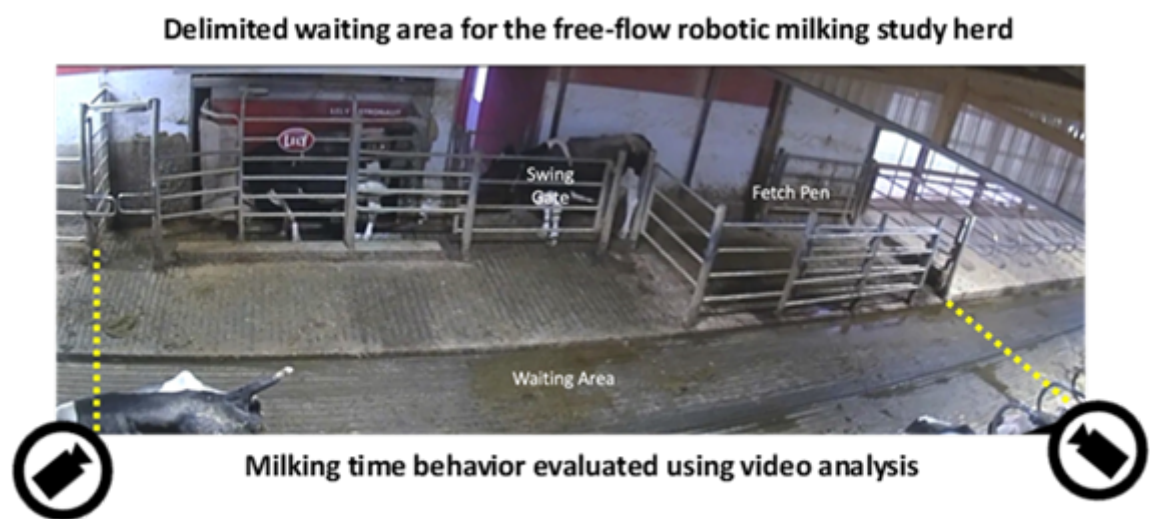
Figure 1. During video analysis, a waiting area for milking (represented by the yellow dash lines) was delineated to resemble a commitment or holding pen close to the milking unit. This waiting area of approximately 49 m 2 (530 ft 2 ) included the space in front of the milking robot and in front of the fetch pen. The time spent in the waiting area was determined as the time when each cow entered and exited the waiting area with or without a successful milking.