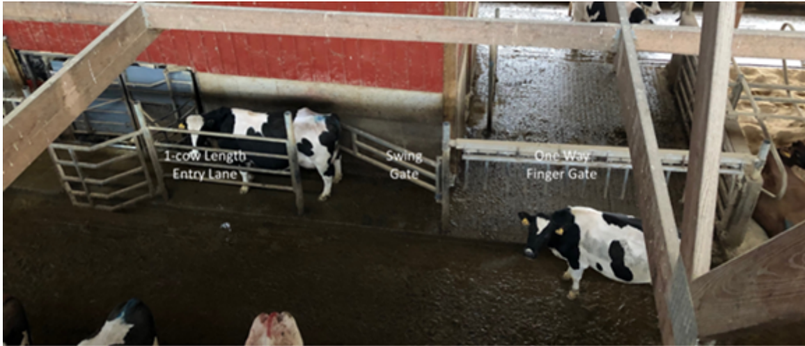
Figure 3. Example of a robot entryway gating design that protects the neck and shoulder of the next cow in line to discourage agonistic behavior.